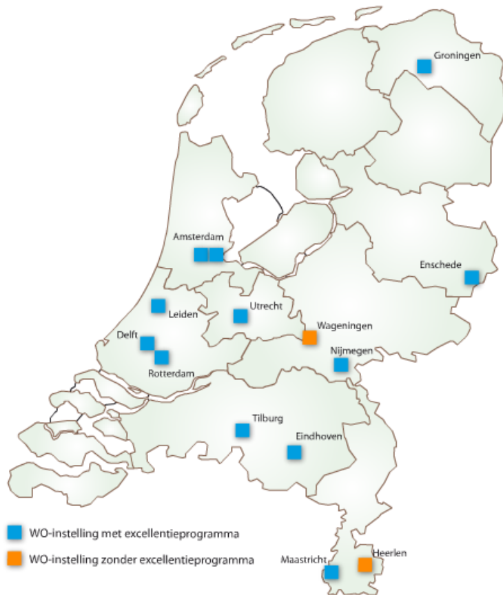
Aanbod excellentieprogramma's op WO-instellingen